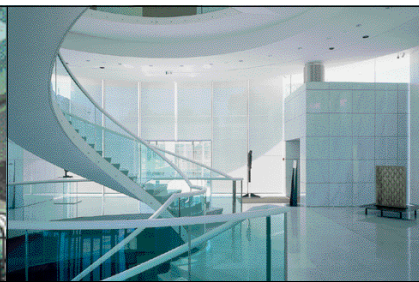
INTERIOR PLEATED CANOPY